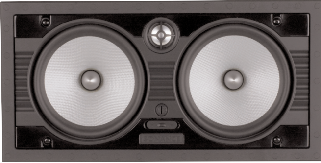
VP67LCR (WITHOUT GRILLE)